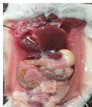
Fig 4: hydatid cysts in t mice injected with exposed protoscoleces for 10 seconds, four months post infection

The different letters indicate significance, while the similar letters indicate insignificance.