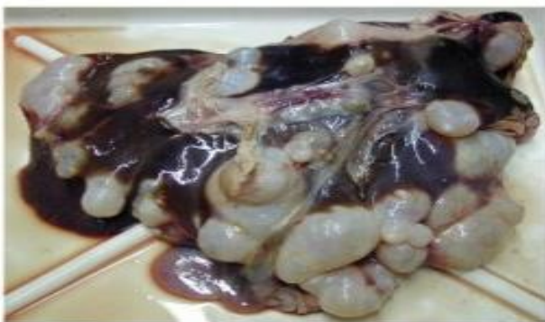
Figure 1: Larval stages (hydatid cysts) in the liver of sheep.

Hydatid cysts were obtained (Figure 1) after being separated from livers of slaughtered sheep in the main abattoir in Mosul, upon arrival to the laboratory, hydatid cysts were examined to accentual the vitality of protoscoleces.