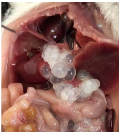
Fig 7: Hydatid cysts in mice injected with unexposed protoscoleces (control group) 4 months post infection