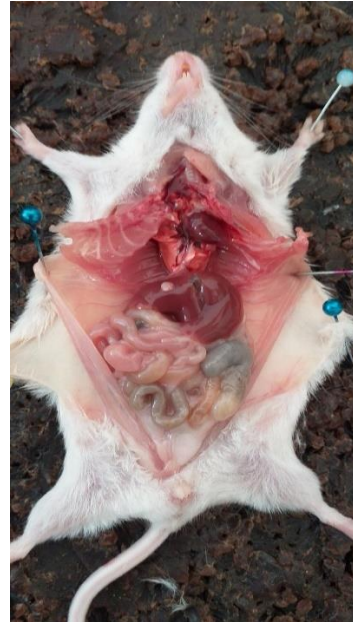
Fig 9: Fig 6: hydatid cysts in mice injected with exposed protoscoleces for 12 seconds, three months post infection