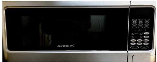
Fig 3. Microwave system

Microwave system (230-240V-50Hz 900W) (Fig 3) was used