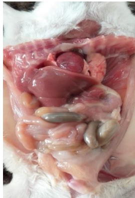
Fig 6: hydatid cysts in t mice injected with exposed protoscoleces for 13 seconds, four months post infection