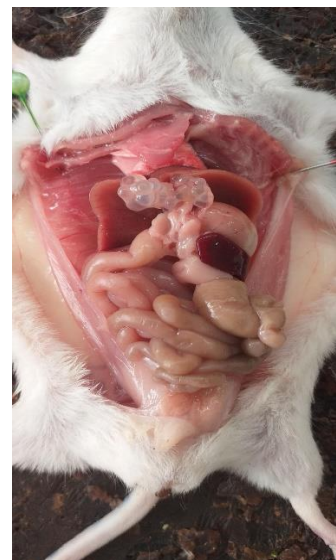
Fig 11: Hydatid cysts in mice injected with unexposed protoscoleces (control group) three months post infection