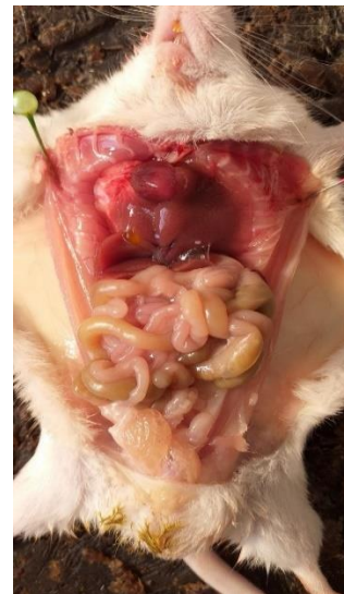
Fig 10: hydatid cysts in t mice injected with exposed protoscoleces for 13 seconds, three months post infection