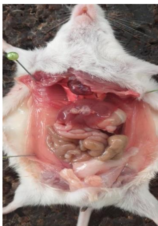
Fig 8: Hydatid cysts in t mice injected with exposed protoscoleces for 10 seconds, three months post infection